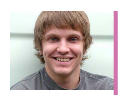
More on pages 8-9

Mentoring and support to help unemployed 18 to 24 year-olds to access training and employment.