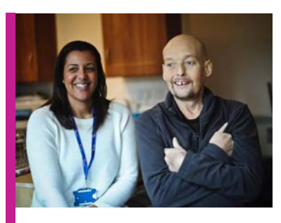
More on pages 10-11